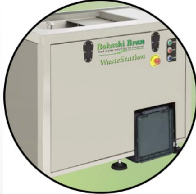
food waste minimisation