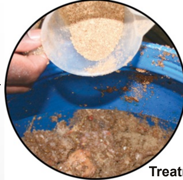
Treatment of food waste with bokashi