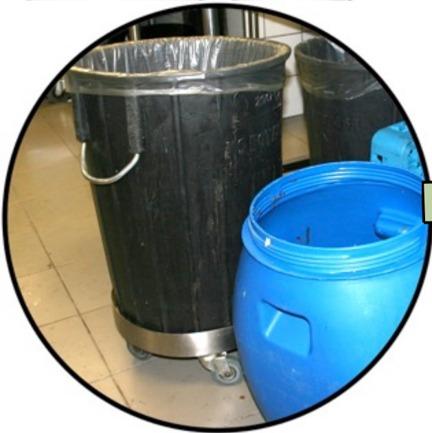
Separate food waste at source