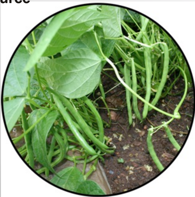
Re-use for planting food